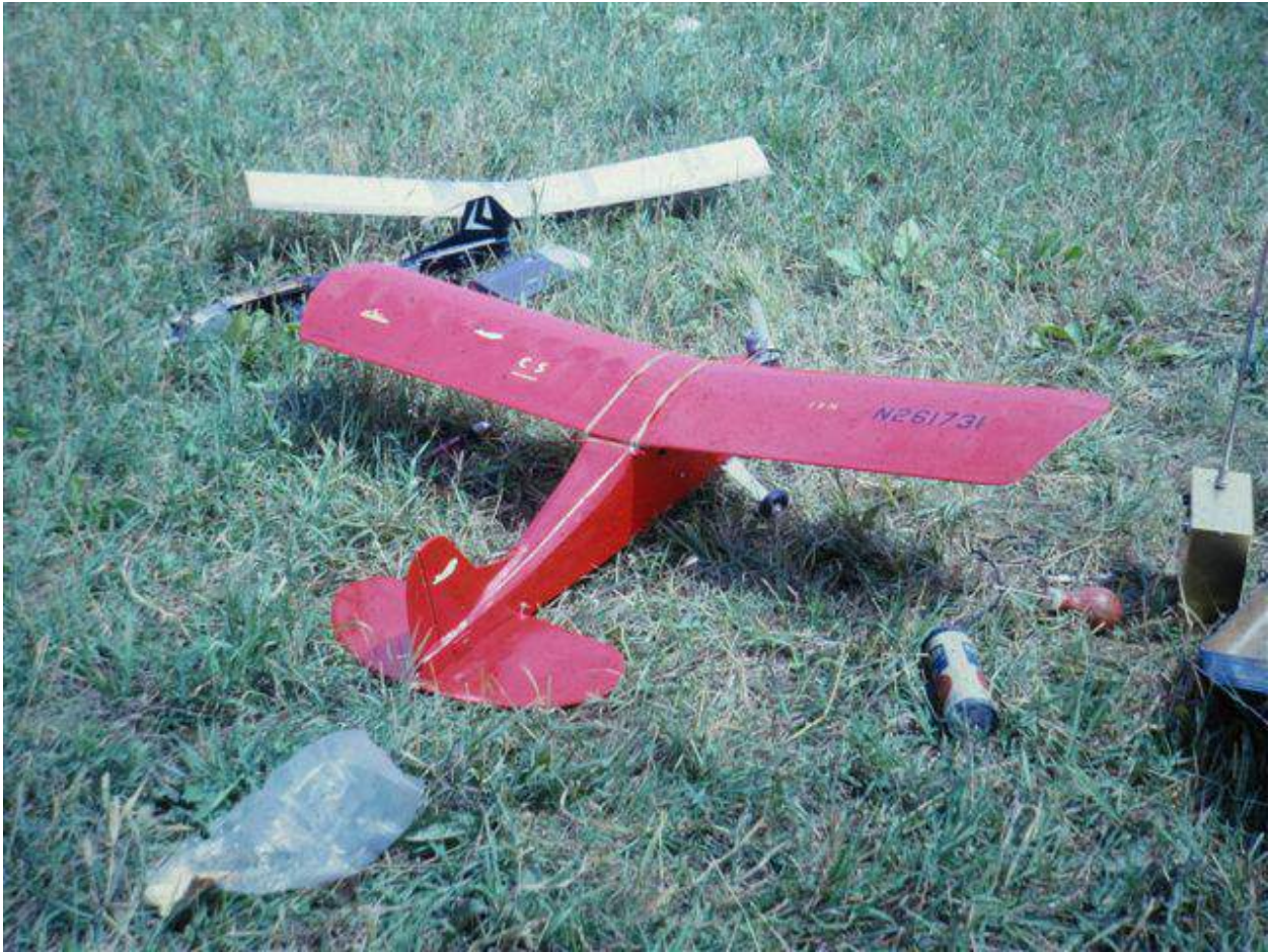
Unknown planes but note the Min-X Transmitter on the ground. This was powered by 6-9 volts compared to 67.5 volts used on older radios prior to Min-X 's new gear. I think the plane in photo is a Mambo a Sterling Kit.