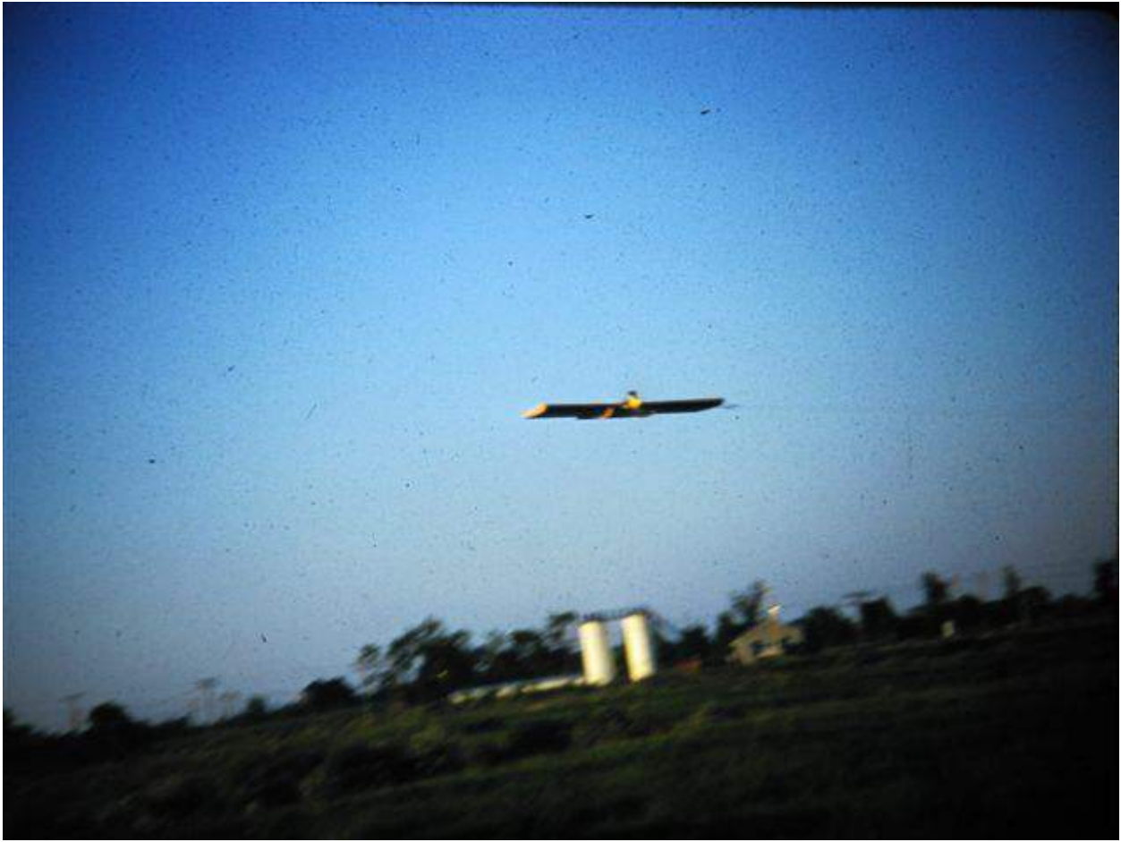
A control-line aircraft (flying wing). Photo taken at Tyotown Road looking west as the Methyl Alcohol Storage Tanks used by Chemcell for shipping out Methanol are in the background.