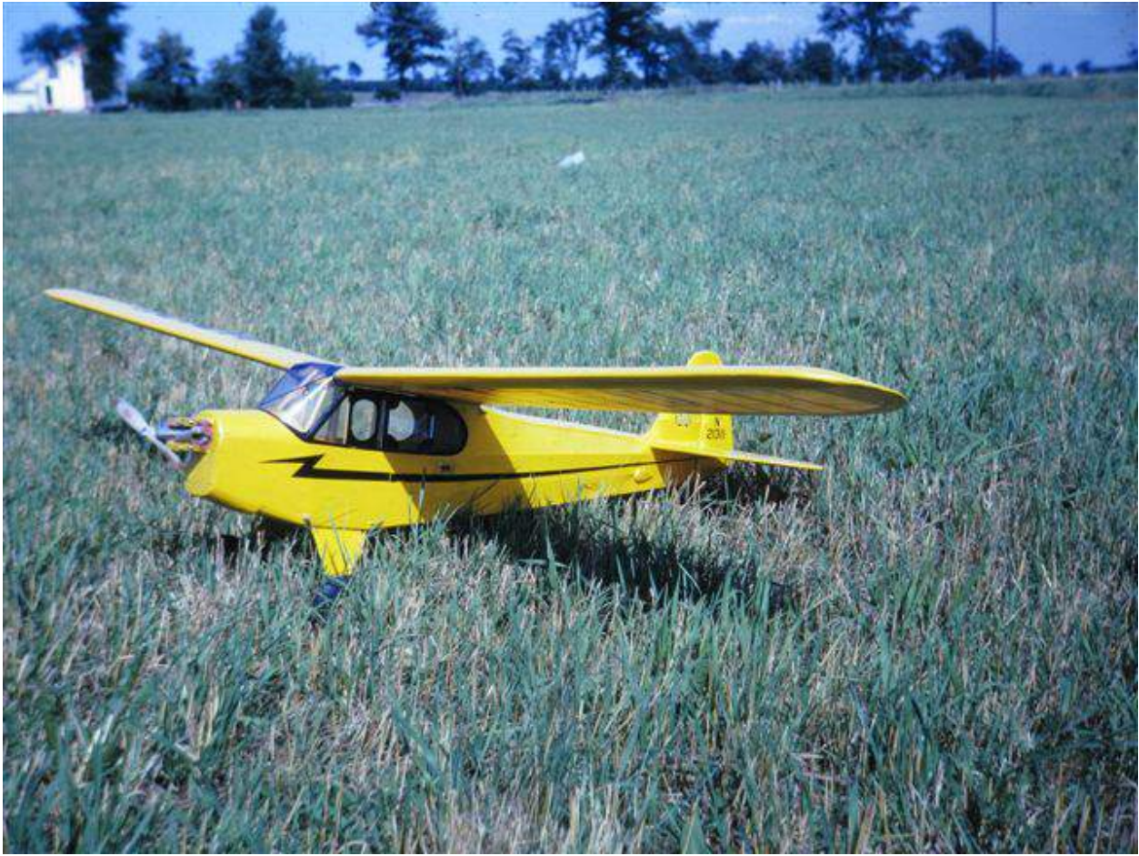
Jack Mott's Piper Cub free flight. Photo taken at the corner of Boundary Road, Tyotown Road and Marleau Avenue circa 1960. Photo taken looking east from Boundary Road.