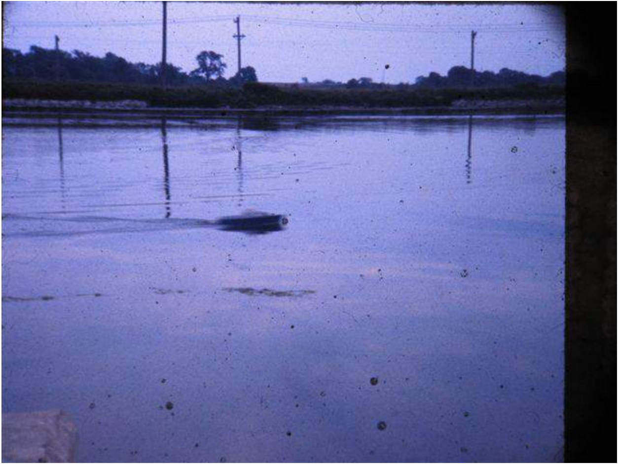
Ian Mavor,s submarine in the Canal near Lock 19 up in Riverdale area.