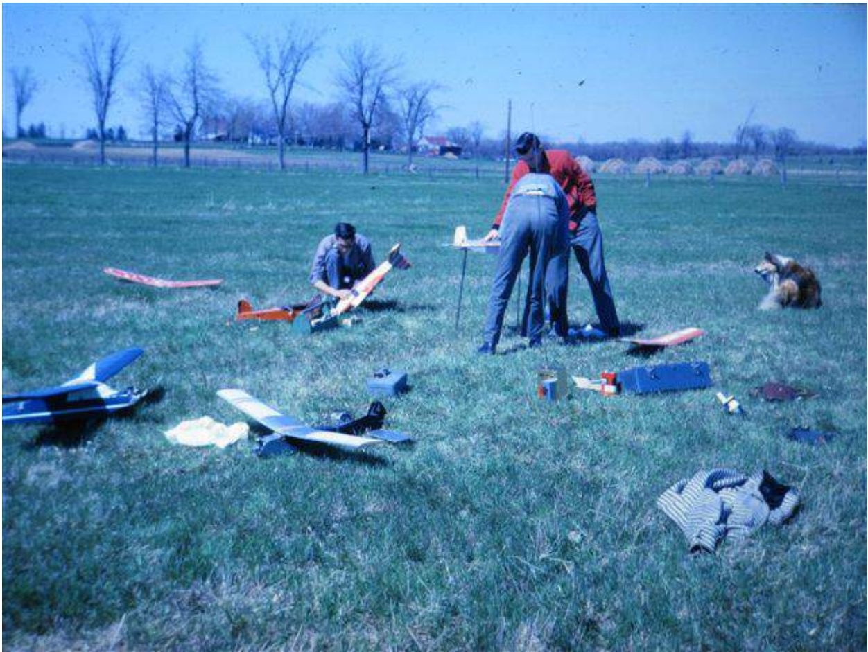
Taken at Tyotown Road looking east. All aircraft in photo were Free Flight. In photo are Gil Rasmussen (back to camera) Paul Potvin (in red shirt) and Cliff Merpaw on the ground.