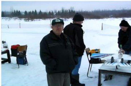
Not everyone was happy