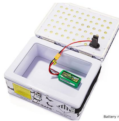
Battery not included